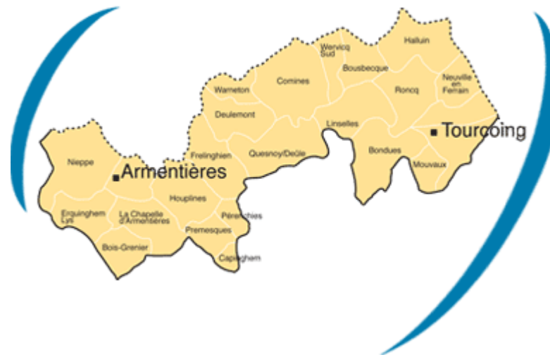
Fig 6.1: CAMHS area Lille Métropole (secteur infantojuvénile)

The EPSM offers inpatient services as well as community based services. One of the important characteristics is the investment in different partnerships, leading towards strong care networks, in a continuum of care.